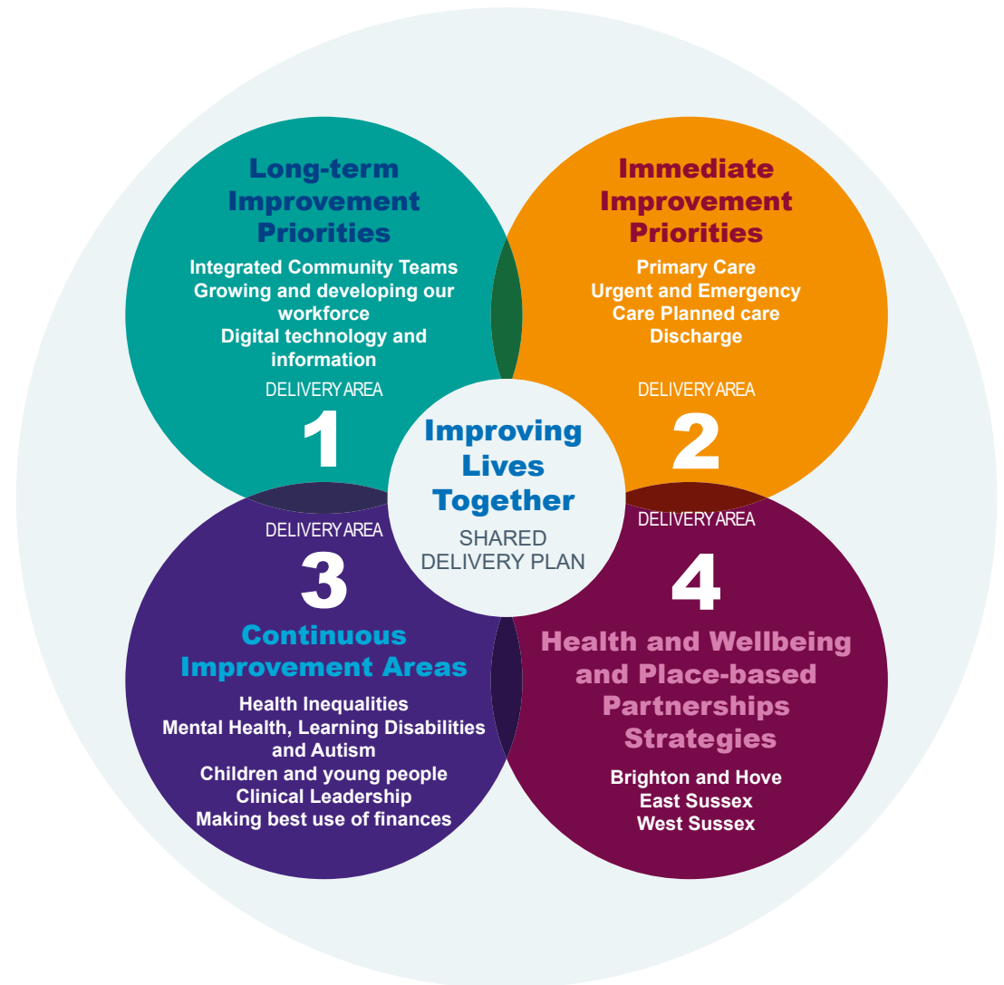
Summary of Sussex Health and Care System's Improving Lives Together Shared Delivery Plan

Health and care research is about generating high quality evidence that enables us to understand, develop and innovate to continuously improve health and care services and population outcomes.